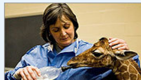
The newest (and cutest) zoo babies from around the world