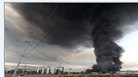
Scenes of the devastation after the Chile earthquake