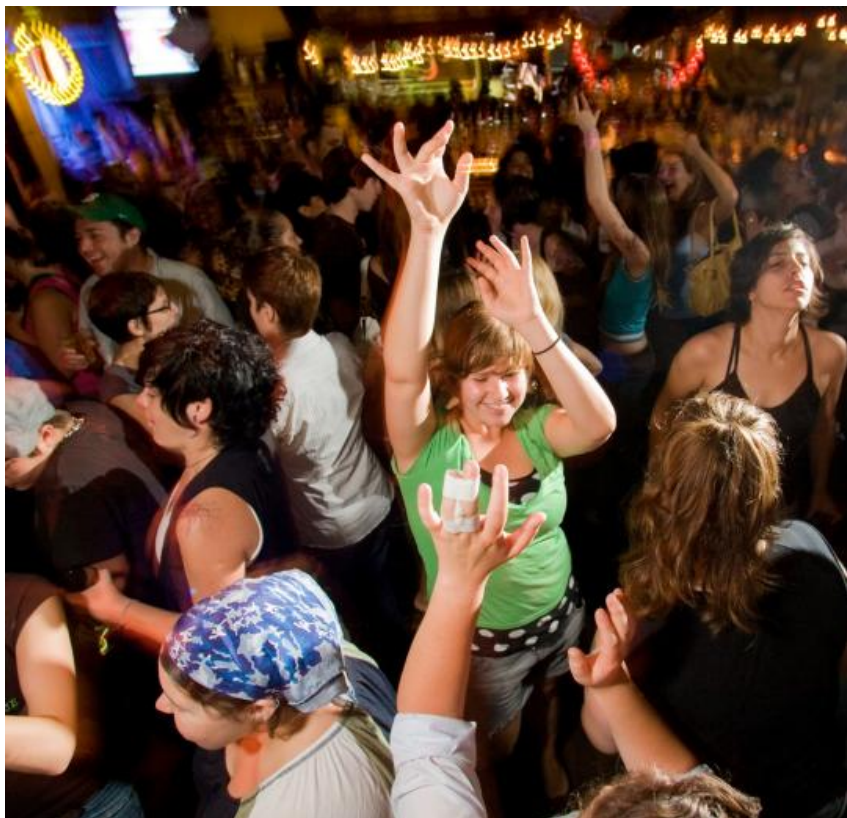
Crowds packed the dance floor at Midway Cafe last summer; for New Year's, the club hosts a dance party benefit called "Sparkle."