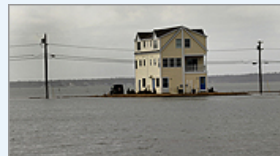
Rising seas and felled trees around the state today